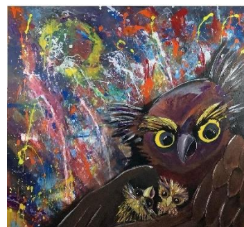
Dean’s artwork (Cudlees)